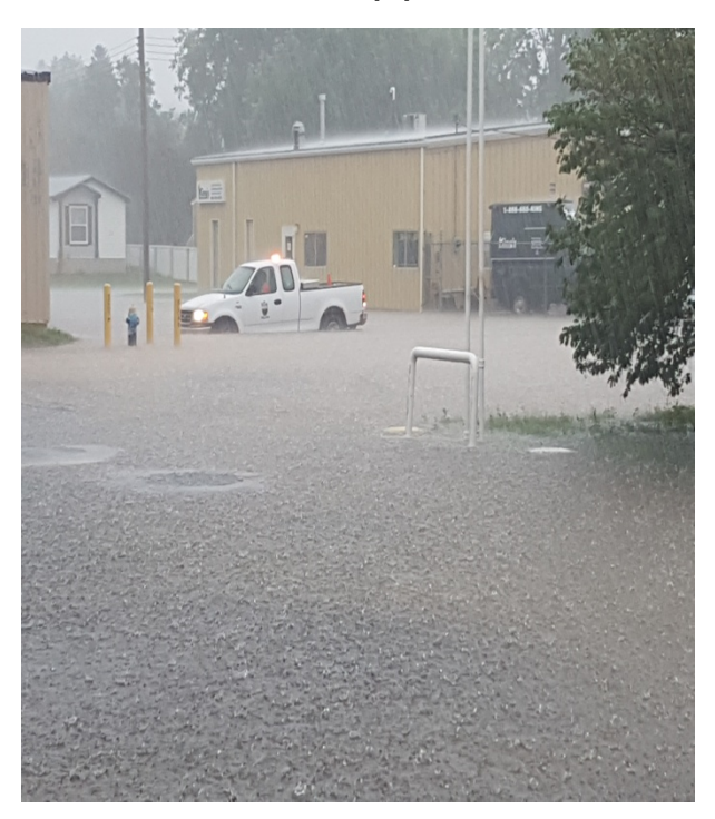
3 hours after application